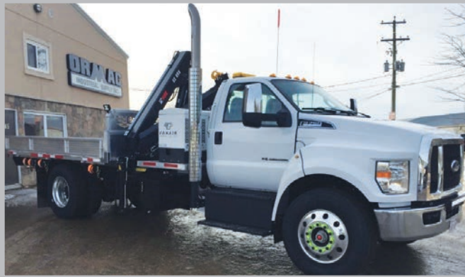
SITE SERVICE TRUCKS