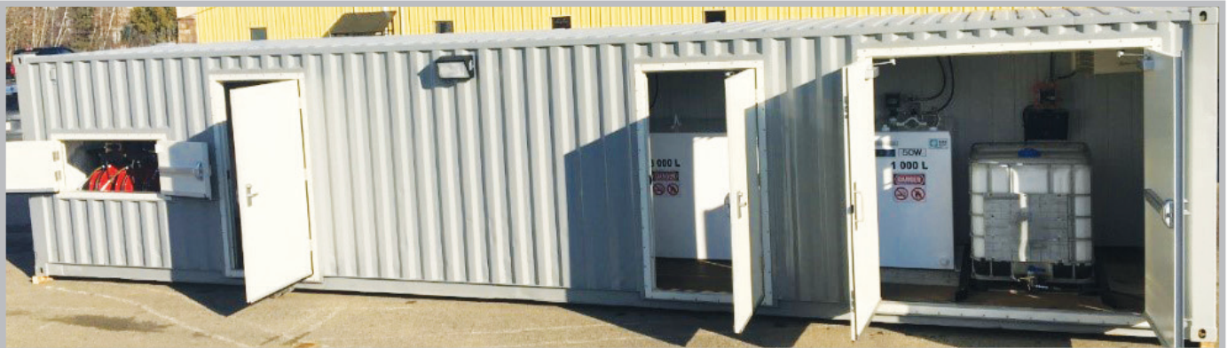
BULK OIL DISTRIBUTION