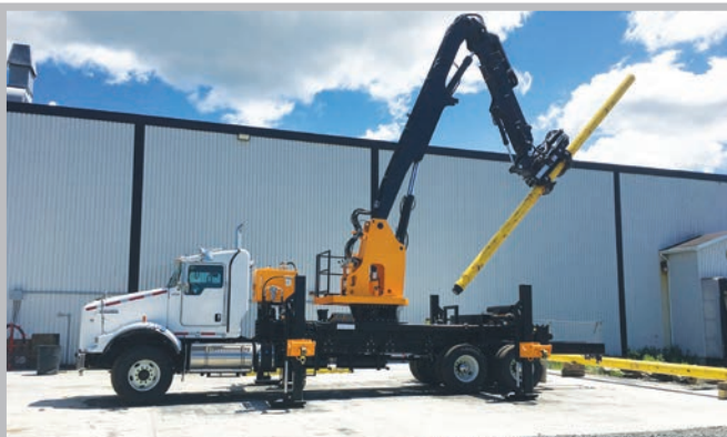
DRILL STEEL MANIPULATOR