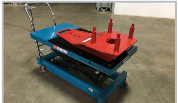
ROCK TRUCK CONTROL ARM LIFT

ORMAC can provide a customized solution for your application.