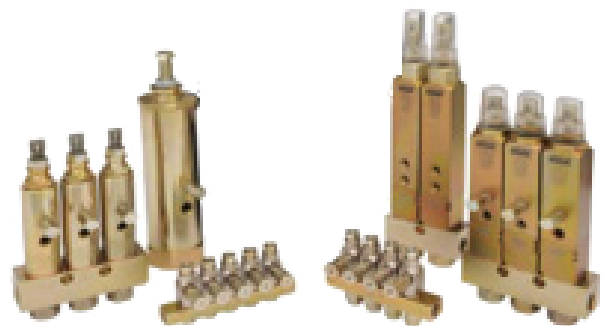
PARALLEL / CENTROMATIC