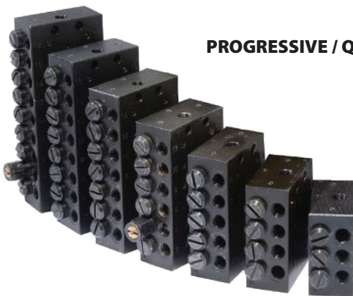
PROGRESSIVE / QUICKLUB

Getting the right lubricant, in the right amount, at the right time, to the right place. ORMAC designs, installs and services automatic lubrication systems for mobile and stationary equipment.